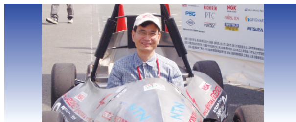
The author behind the wheel of the Chiba University students' formula car, a project on which the author is advising

The biggest problem to date with producing a commercial HCCI engine was that past prototypes could only be used with a throttle opening angle of between 20% and 40%. This meant that when pressing down hard on